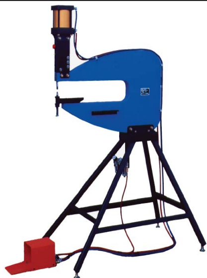
PEDESTAL FOR ALL STATIONARY TOOLS

Our pedestal is ideal for Stationary Tools Model 8000CS and 15KCS. It comes complete with an Air-Filter-Lubricator-Regulator unit. Considering the heavy duty welded steel construction and its design to maximize the versatility of these tools, the pedestal adds great value to your investment. (Model 15KCSA with a 24" reach pictured above.)